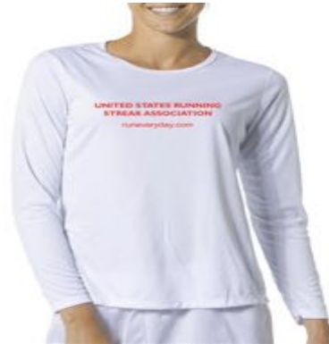
USRSA Women's Long Sleeve