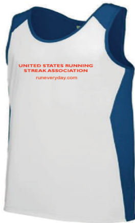
USRSA Men's Singlet