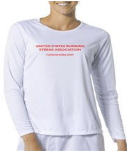
USRSA Women's Long Sleeve