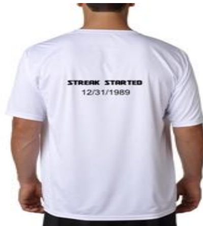
Optional "Streak Started" Date