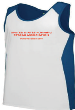
USRSA Men's Singlet