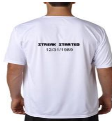
Optional "Streak Started" Date