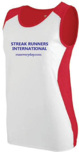
SRI Women's Singlet

Please go to http://www.clearlybranded.com/showrooms.htm and then click SRI/USRSA logo to order your singlet, pullover, short or long sleeve shirt! For an additional $5, get your “Streak Started” date printed on the back of your singlet or shirt!