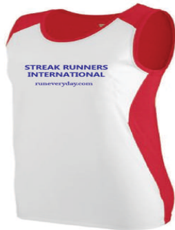
SRI Women's Singlet

Please go to http://www.clearlybranded.com/showrooms.htm and then click SRI/USRSA logo to order your singlet, pullover, short or long sleeve shirt! For an additional $5, get your “Streak Started” date printed on the back of your singlet or shirt!