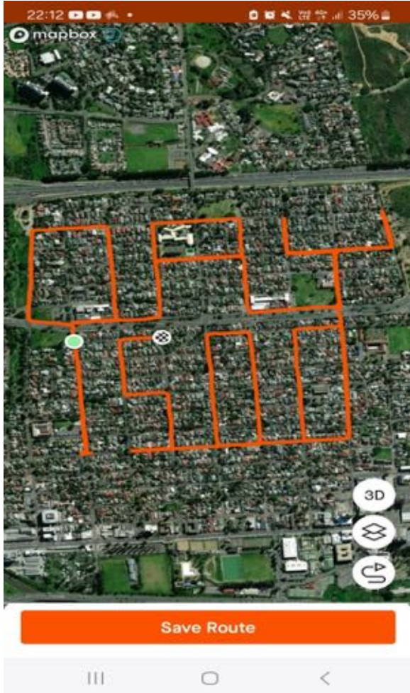
RSD 1500 Route of Glanville Retief